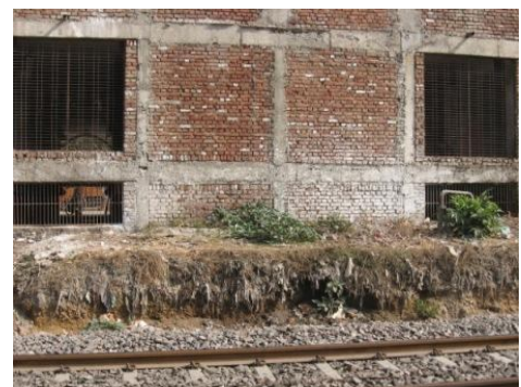
Figure 2 weak column and strong beam design