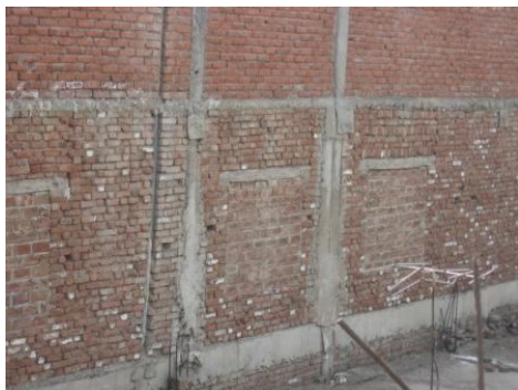
Figure 3. Pipe installation through beams and walls

Non structural elements basically included masonry infill, holdings etc. One surprising thing was reinforcements through masonry columns.