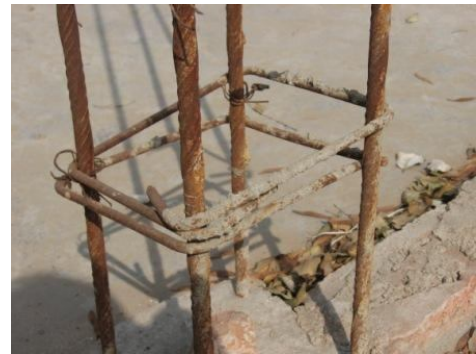
Figure 3. 90 degree hooks