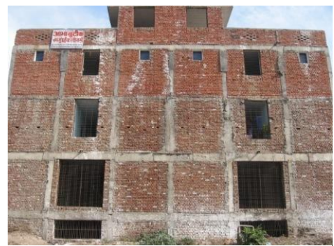
Figure 1(i) RC frame building with masonry infill (ii) short columns in the first floor

As can be seen from the building it follows the "weak column-strong beam". During earthquakes forces are transferred from beams to columns, so column should be