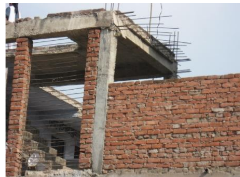
Figure 4 Poor beam column connections

Diagonal slabs and beams were used in staircase. These elements attract large earthquake forces and can damage the parent structure by pounding and crushing effects.